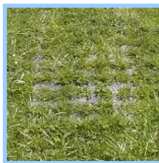
Grass grows back through the tiles