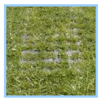
Grass grows back through the tiles