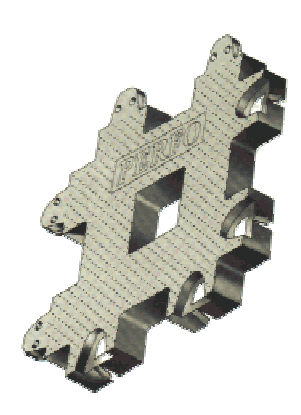
Interlocking PE-PP Tiles Effective ground reinforcement systems